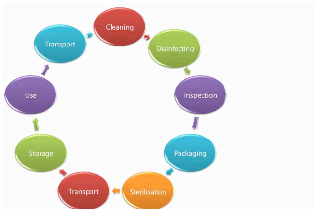
Figure 1: The Decontamination Cycle

The supply and demand chains for surgical instrument sets are complex. There are two distribution channels needed to get the product to the end user: a surgeon or another medical professional. Firstly there is the macro supply chain; when an instrument set is loaned between hospitals or when it is loaned or consigned to a hospital from a commercial loan set provider. Secondly there is the micro distribution channel; the decontamination process that occurs within the four walls of the CDU. Importantly, continuity of traceability between these two supply chains is a key factor in ensuring patient safety.