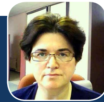
by Pauline Biggane

The Health Service Executive (HSE) is the government agency responsible for the provision of public healthcare services for everyone living in Ireland. The HSE now requires that all surgical instrument trays are identified using GS1 Standards to enable stakeholders to track and trace them throughout the supply chain. The system currently being rolled out is designed to create a collaborative, interoperable, and nationwide traceability solution for Central Decontamination Units.